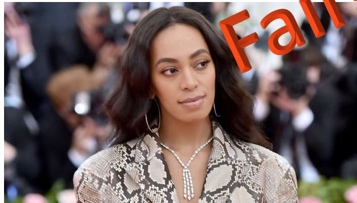
Solange Knowles – ADHD