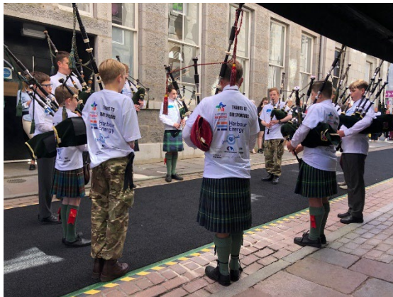
Umbrella installation