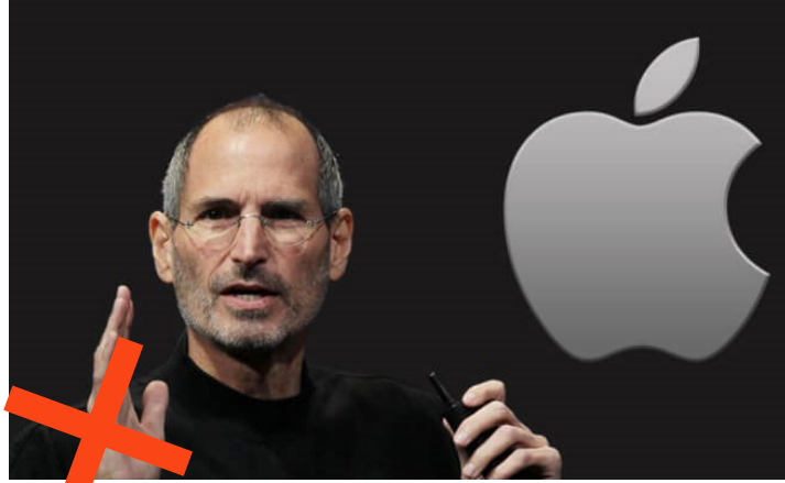
Steve Jobs – Dyslexia