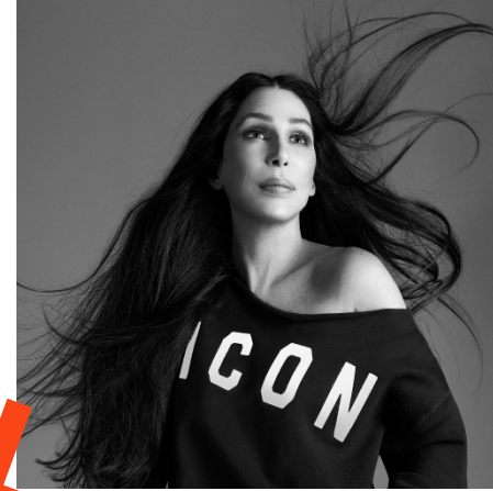
Beyoncé – Dyscalculia & Dyslexia