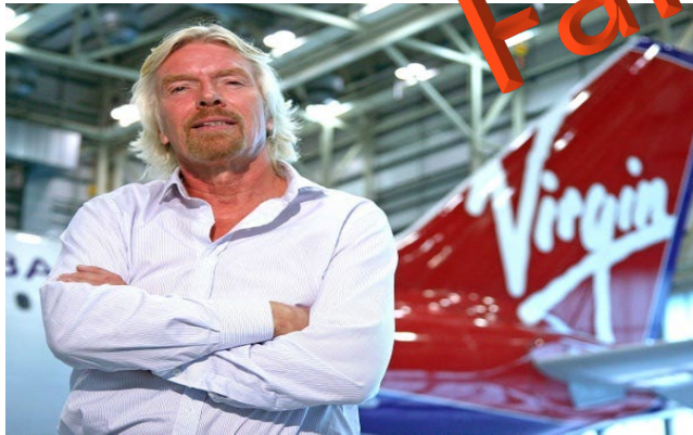
Richard Branson – Dyslexia & ADHD