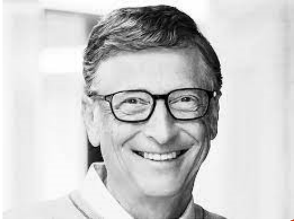
Bill Gates – Dyslexia & ADHD